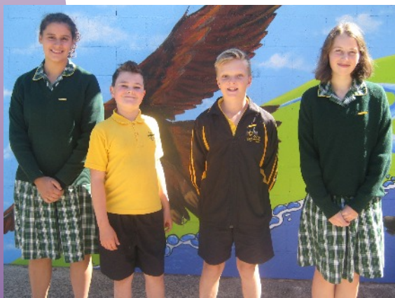
2020 HOUSE CAPTAINS