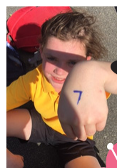
2022 Cross Country