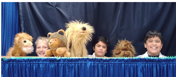
Fun creating puppet shows with Mrs D in Chapel!