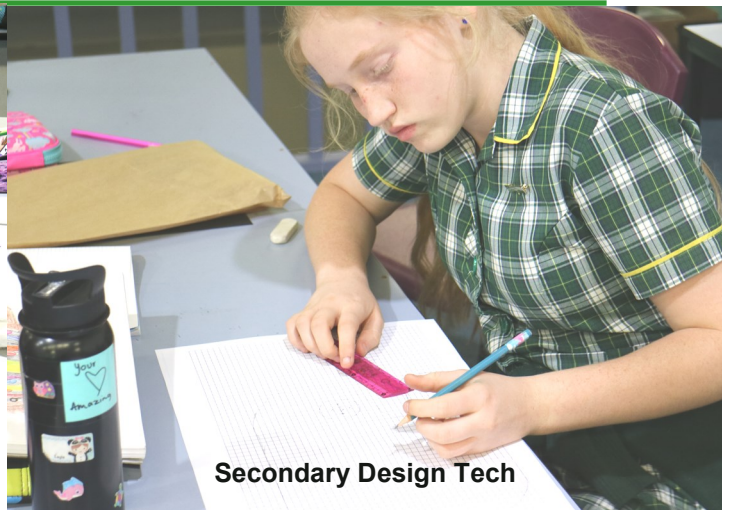
Secondary Design Tech

OLIVET CHRISTIAN COLLEGE 89 Main Rd Campbell's Creek 3451 Phone (03) 5472 3817 Fax (03) 5470 6871