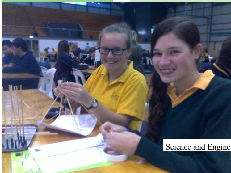
Science and Engineering Challenge